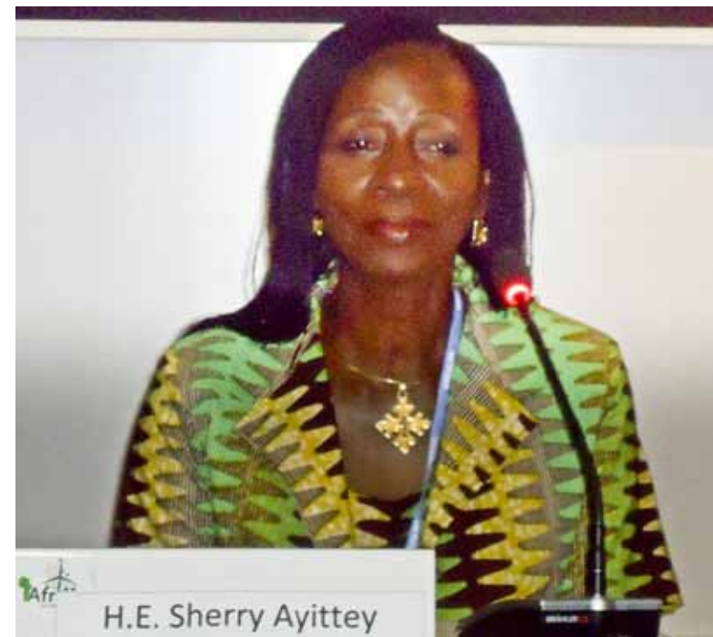
Ghana's Environment and Science Minister, Sherry Ayittey

On adaptation and finance, the Minister Africa wanted Durban to agree on a review of the Clean Development Mechanism (CDM),