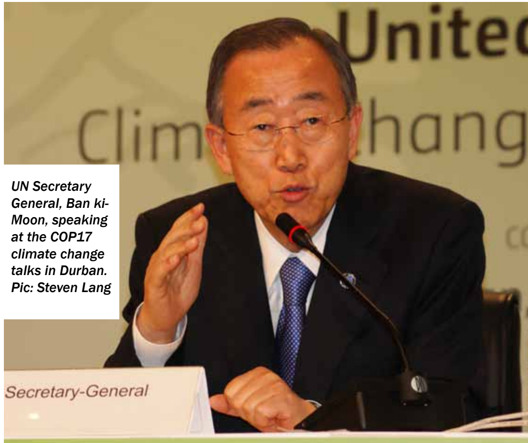
UN Secretary General, Ban ki-Moon, speaking at the COP17 climate change talks in Durban.

United Nations Secretary General, Ban ki-Moon, has urged struggling climate change negotiators at the COP17 talks in Durban to press ahead for solutions because the future of the planet is at stake. He rejected any excuses that the global economic crisis was partially responsible for the delay in setting up an international fund to help countries combat the effects of climate change.