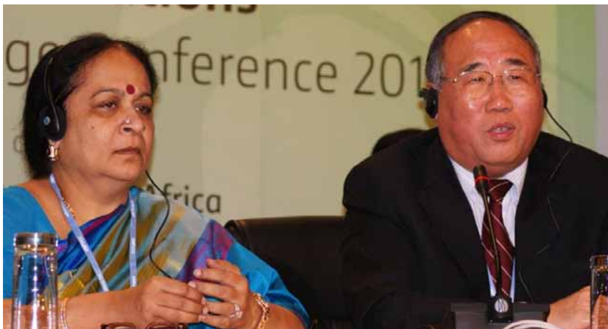
Indian Environment Minister Jayanthi Natarajan and chief negotiator for the Chinese delegation, Xie Zhenhua, both support a second commitment period for the Kyoto Protocol.

Zenawi said the funding of projects to cope with the consequences of climate change was vitally important to Africans as they were the most affected by its devastating effects.