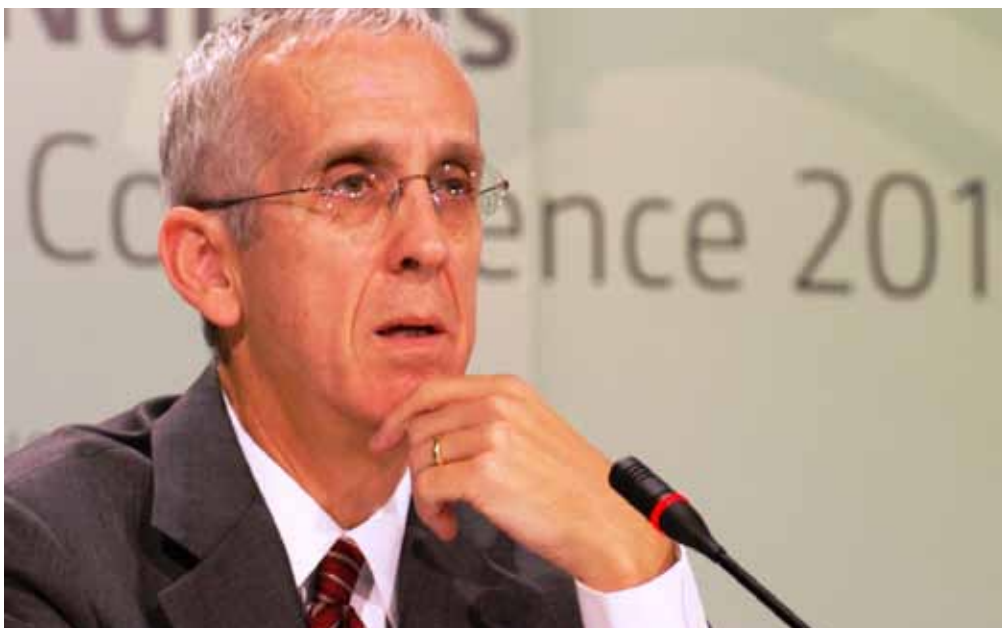
Todd Stern, head of the United States delegation to the Durban climate change talks.

The CDM allows a country with an emission-reduction or emission-limitation commitment under the Kyoto Protocol to implement an emission-reduction project in developing countries. Such projects can earn saleable certified emission reduction (CER) credits, each equivalent to one tonne of CO 2 , which can be counted towards meeting Kyoto targets.