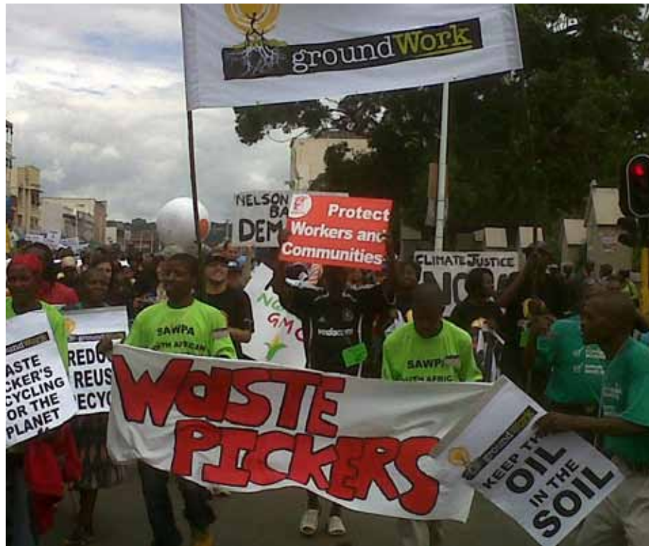
Global Waste Pickers alliance take their place in the Global Action Day march through Durban on Sunday.

Organisers say they have been active in Durban for a few weeks, and their raised voices and messages are “finally catching on”.